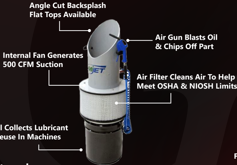
Flat Top Mi-JET Angled Top Mi-JET