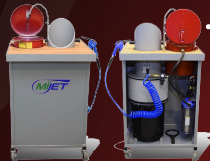
Solvent Container For Washing Parts