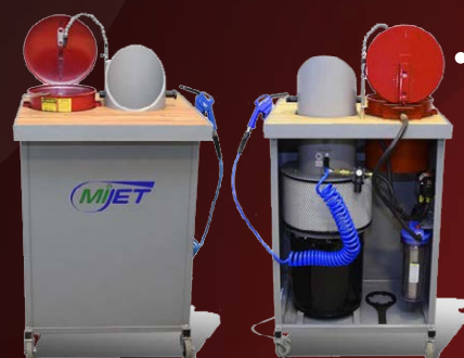
Solvent Container For Washing Parts