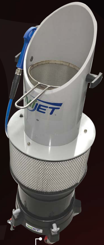
Optional Casters For Ease Of Transport