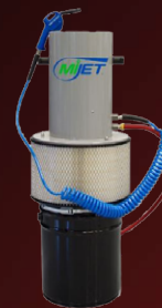
Angled Top Mi-JET